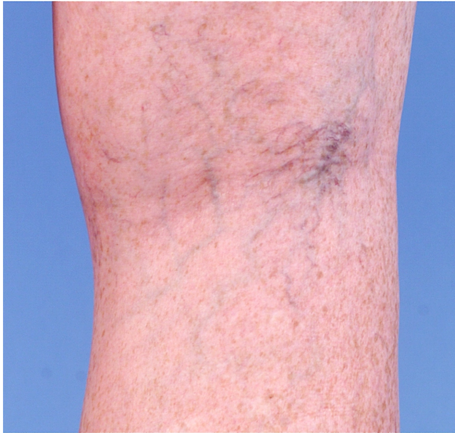
prior to treatment